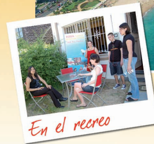
En el recreo